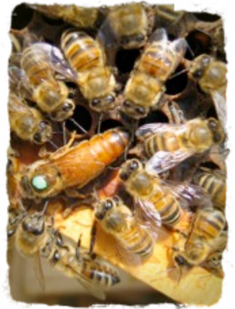
A Queen Bee

Hygienic These bees keep the hive clean and tidy and remove any dead bees.