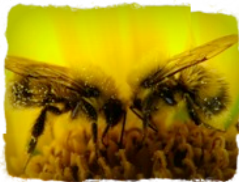
Bees pollinating a flower

One out of every three things we eat needs a bee to pollinate a plant - even meat since farm animals eat plants too!